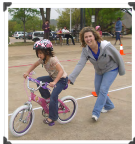
3rd Annual Huffman Bike Rodeo on April 4, 2009