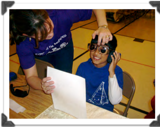
Experience the Awareness