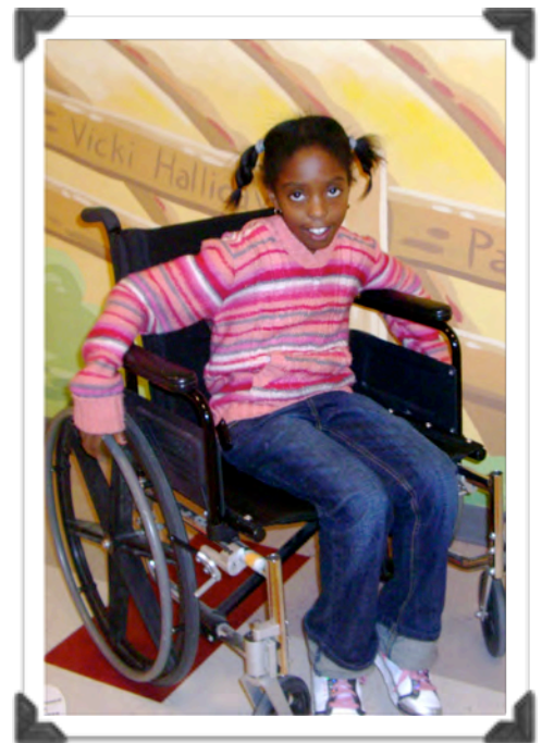
Experience the Awareness on February 19 was a huge success!