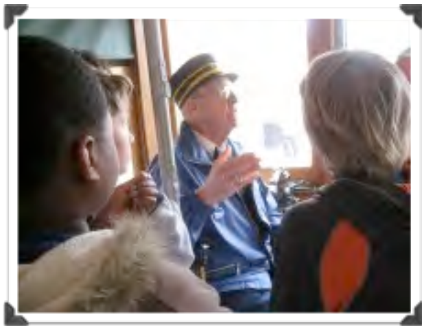
Students listen as the train conductor demonstrates what life was like on an early 1900s train car.